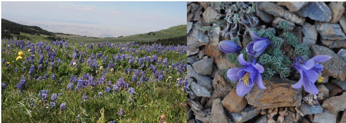
Lupines on the Bighorns

One of the days we will drive to the summit of the Bighorn Mountains, which are largely composed of dolomitic limestone. This area is almost mythical for its wildflower displays, and there are many unusual and some very rare plants that are only known from here and a few neighbouring spots: the gorgeous Jone's columbine ( Aquilegia jonesii ), Kelsey moss ( Kelseya uniflora ) and the western dwarf cliffbrake ( Pellaea glabella ssp. occidentalis ) are just a few of the gems we will see.