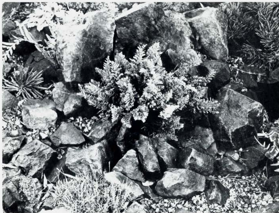
Figure 1— Cryptogramma crispa var. acrostichoides , the Parsley Fern, well established in a rock garden.

Cryptogramma crispa is a complex with several varieties, with the typical form occurring in Europe. Variety acrostichoides is called the American Parsley Fern, but also occurs in eastern Asia and differs from the typical by having leaves of a thicker texture. The principal problem encountered in the