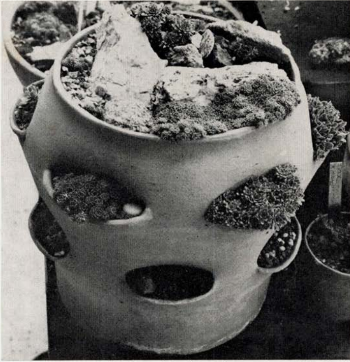
Draba and Saxifraga in a Strawberry Jar