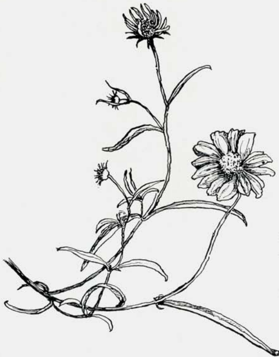
This western composite has become straggly under eastern conditions.

usual results: a few rows of seed never came up, but all the others did, not seeming to miss the sifted layer at all—primroses and gentians with their incredibly fine seeds, erigerons, rydbergias, androsaces, calceolarias, sedums, saxifrages, poppies, polemoniums, etc. No more sifting for me!