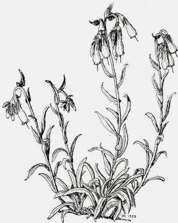
Drawings by Doretta Klaber

plants that overgrow them later, rather than to let them "fight it out": the androsaces will not win. No tiny weed must crowd a baby androsace. An inch high weed, when pulled, may tear fifty baby androsaces from their moorings. I can give no better advice than to say, plant androsaces as early as possible where they are to grow and leave them alone . They will stand no foolish gardener's foolish whims, but they are hardy and they are easy, and they can be raised from seed with a slightly more careful method than is demanded by alyssum or the shrubby penstemons.