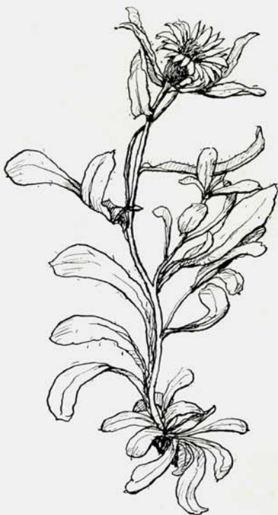
The "drooping senecio" is actually a form of Chrysopsis villosa .

Primula fauriae alba , of which I spoke last year, came up in both white and pinkish lavender. They are much like P. farinosa and P. frondosa . Their leaves are tiny when they first come up in spring, but develop into a clump about three inches across. The leaves have yellow farina on the reverse instead of white, unlike the others, and they look as though they would be sturdier plants.