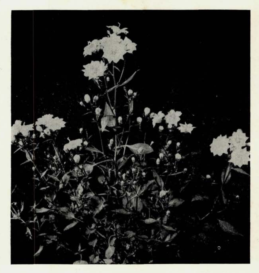
Campanula warleyensis, a late-blooming, semi-double white hybrid.

reasonably hardy. In fact, if members of our Society were to send in a list of those plants which in their gardens are late bloomers, it would no doubt stimulate many of us to try some of them. It might even be interesting to devote a section of the garden just to these plants.