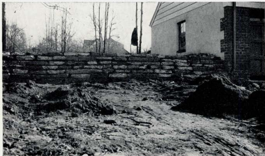
The dry wall before planting

After spreading an inch or so of soil on top of the first layer, we laid a second tier of the concrete pieces about an inch further back and slightly sloping into the bank, making sure that no two joined directly above a joint in the layer below, except where we occasionally wanted a long vertical opening for certain plants. As we built, we filled back of the wall with eight to twelve inches of prepared