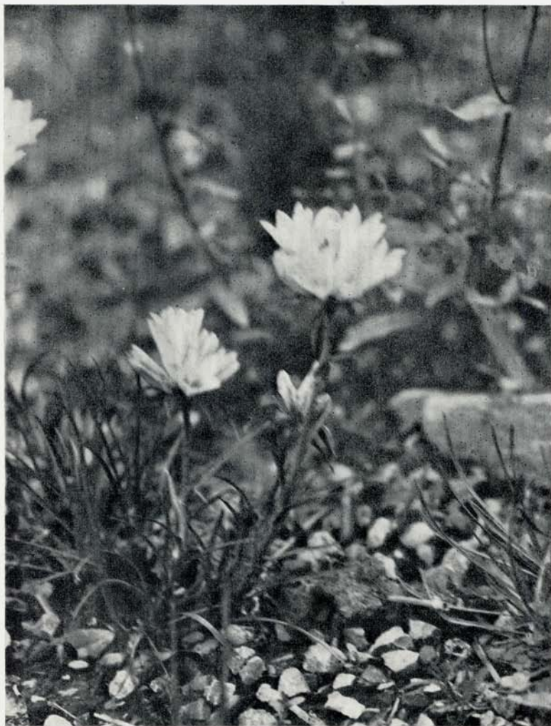
Edraianthus graminifolius flowering in Cincinnati

list of the six most indispensables" raises in me the hope that some day I may be able to secure it. Pumilio has also received high praise. As its name implies, it is a very dwarf growing plant, almost as low as Silene acaulis . This plant I have had for two years, but as yet it has declined to bloom. It has numerous tiny stems rising from the base, with the thinnest imaginable short grassy leaves. I have seen a picture of the plant in full bloom, with scores of erect violet-purple flowers that almost conceal the leaves.