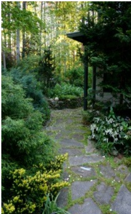
View from the porch

There is always much to be done to prepare any landscape to receive plants that ultimately give the landscape design its final form and character. The property my husband and I purchased in 1991 was largely wooded and the previous owner had spent 3 years clearing all the underbrush and thinning smaller trees leaving behind mature Loblolly Pine, White and Turkey Oak, Sweetgum, Sassafras, Sourwood, Maple, Elm, Tulip Poplar and Black Gum. I had a clean slate to begin my gardens in these woodlands. I started from the house and continued to expand out under the trees with pathways, little side rooms, and destinations clothed with various plant combinations each year.