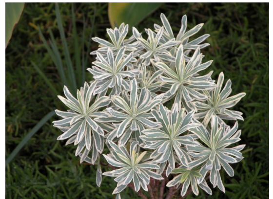
Tasmanian Tiger Spurge

General attributes: E. characias ‘Tasmanian Tiger’ is a dense rounded shrub with grey-green foliage edged with white. In spring the flower heads emerge in clusters up to 6 inches across and potentially a foot long. The showy “flowers” are actually specialized leaves surrounding the inconspicuous true flowers. These specialized leaves will remain showy for an extended period after the flowers fade. ♪