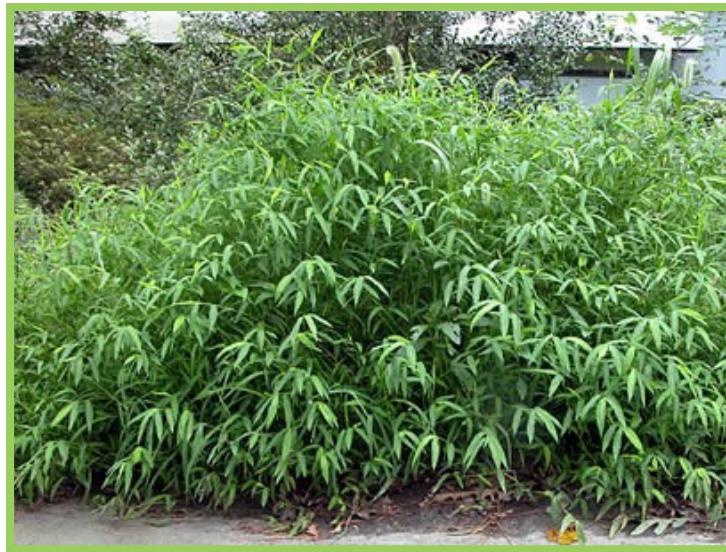
Microstegium vimineum (Japanese stilt-grass)

The name "weed" is from Old English weod and Anglo-Saxon wiod , a general all-purpose word for herbs, grass, or weeds. "Weed" is not a botanical or horticultural designation. Which plants are weeds depends on one's viewpoint. Ralph Waldo Emerson said in 1878 that a weed is "a plant whose virtues have not been discovered." Thus, a weed is a plant growing where it is not desired or is unwanted and generally objectionable.