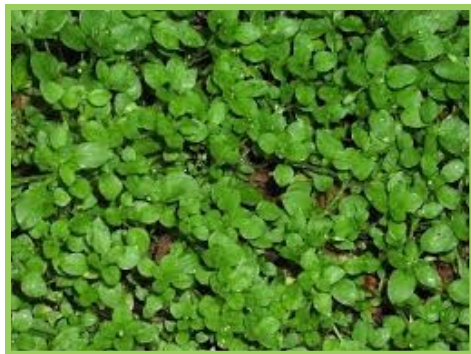
Stellaria media (chickweed)

September is the anniversary of Hurricane Fran's visit to the Triangle in 1996. Fran taught me a thing or two about weeds when it brought down thirteen large deciduous trees in the garden. The shade that disappeared with the trees provided just the environment for unwanted plants whose seeds lay dormant in the shade, perhaps for years. The first season after Fran, the comely pokeweed ( Phytolacca americana ) popped up by the hundreds, producing messy berries that were enjoyed by, but further spread by birds. After controlling pokeweed, two years later the soil produced an invasion of poison ivy ( Rhus radicans ). Having brought it under control by the third year, I have since continued to combat Microstegium vimineum (Japanese stilt-grass) and Stellaria media (chickweed)—a procession of plants that had been previously rare in my garden.