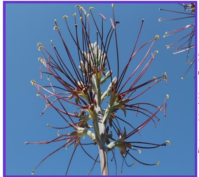
Manfreda undulata ‘Chocolate Chip.’