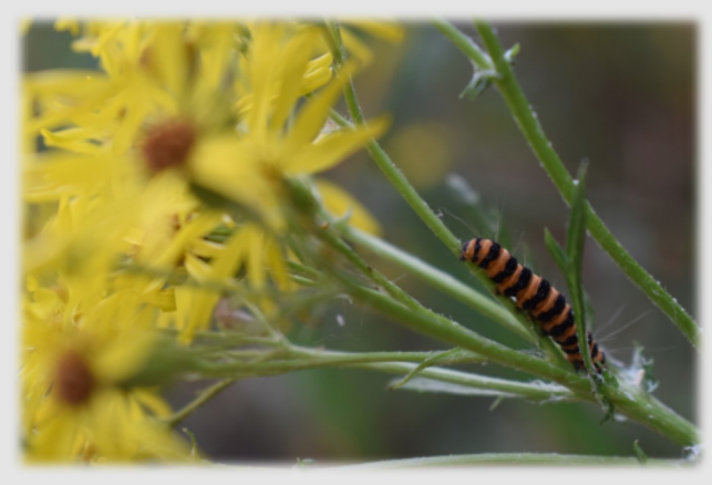
Tyria jacobaeae on Jacobaea vulgaris

interspersed with their distinctive dark brown club like seed heads just beginning to shed into fine cotton. On the damp bank primitive whorled stalks of Equisetum bridged the area to higher and dry soils where more Anaphalis , Jacobaea , Chamerion and grasses filled in. The small tubular soft pink flowers of Collomia linearis just beginning to open from their spiraled petals into stars just peaked up out of the grass.