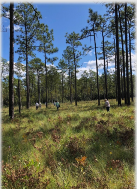
Green Swamp savanna

On October 13, 2019, thirteen members of the Piedmont Chapter of the North American Rock Garden Society spent the day in North Carolina's southeastern coastal plain in Brunswick County. We went there to see one of the state's jewel natural heritage sites, the Green Swamp, an area of wet shrub bogs (pocosins), and drier longleaf pine savannas; the latter are open, park-like areas with an herbaceous understory. We spent most of the time in the dry longleaf pine savanna, an ecosystem that once covered much of the coastal plain from southeast Virginia to the Gulf Coast westward to east Texas and comprising some 130 million acres. The habitat is known ecologi-