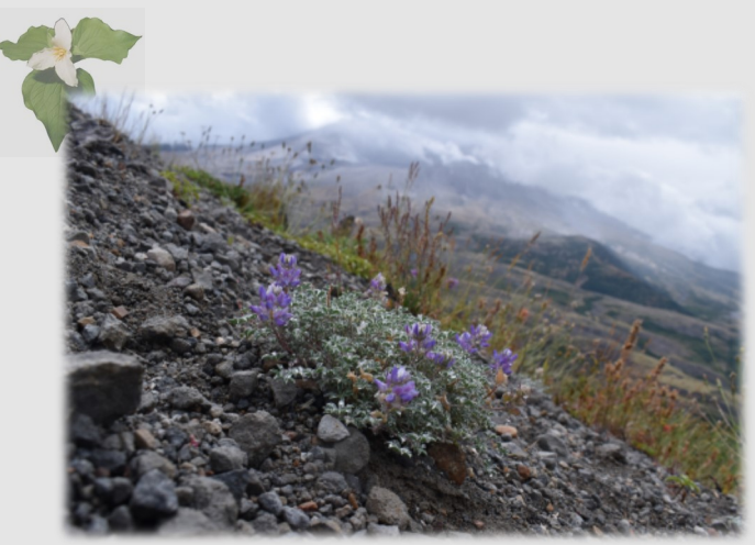
Lupinus brewerii and Mount St. Helens

partially obscured by low clouds and sheets of light rain falling in the distance. Along another trail near the viewpoint, prostrate succulent