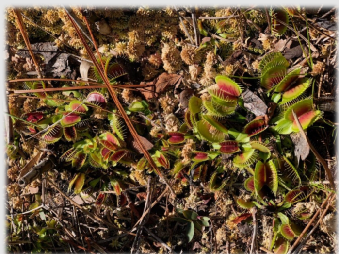
Dionaea muscipula Venus' Flytrap

grazed cattle in the slightly elevated drier savanna areas, still known as Calf and Cow islands. In the early twentieth century, drainage operations were initiated in