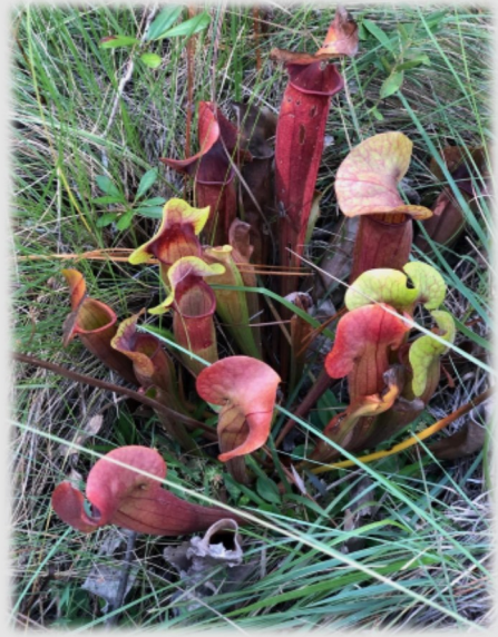
Sarracenia x catesbaei (S. flava x S. purpurea)

parts of the swamp to improve access for logging and to create pine plantations. The preserve is currently owned and managed by the North Carolina Chapter of The Nature Conservancy, having acquired the land beginning in the 1970s as a donation from Federal Paper Board, a timber management company.