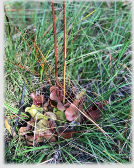
Sarracenia purpurea Purple pitcher plant