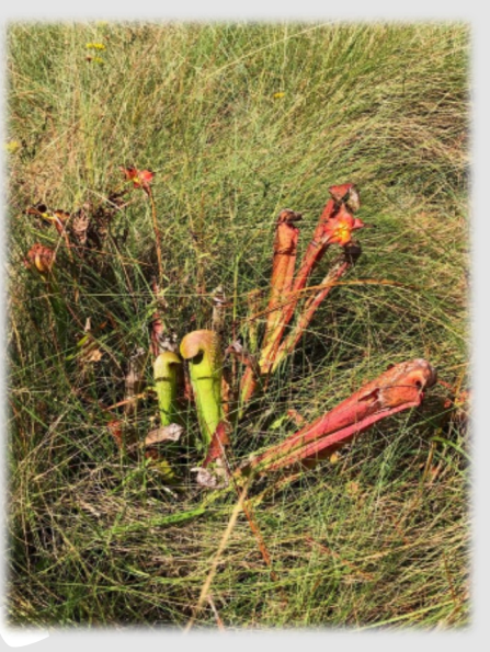
Sarracenia minor Hooded pitcher plant