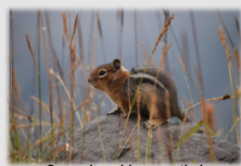
Cascade golden-mantled ground squirrel