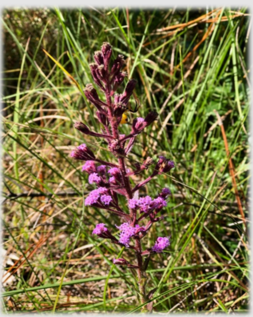
Carphephorus paniculatus Deer's tongue

chids and carnivorous plants, evolved in these savannas and they became reliant on frequent fires for their existence. And native Americans learned to use fires to maintain these areas for agriculture.