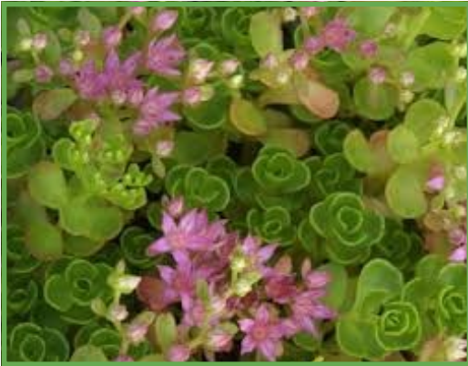
Sedum ' John Creech'