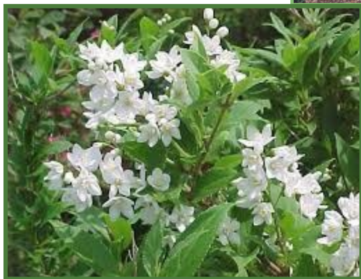
Deutzia gracilis 'Nikko'