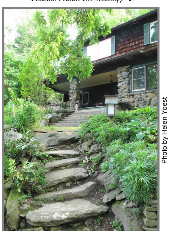
Entrance to the House