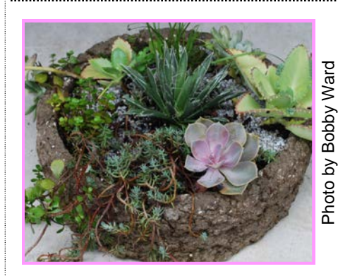
Table center pieces for the Saturday night Banquet made by