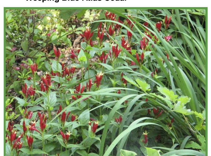
Spigelia marilandica (Indian pink)