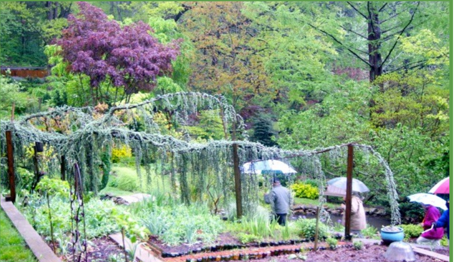
Weeping Blue Atlas Cedar