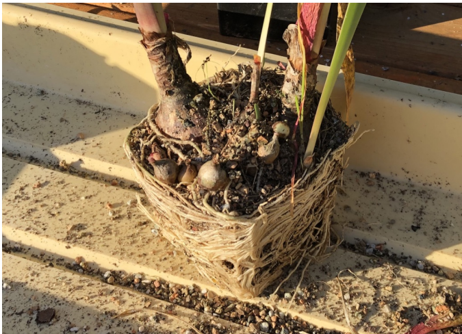
Very root-bound with many offsets

I mentioned they don't mind overcrowding. Below is what C. elatus x montanus looked like after 4 years of growing from a small bulb.