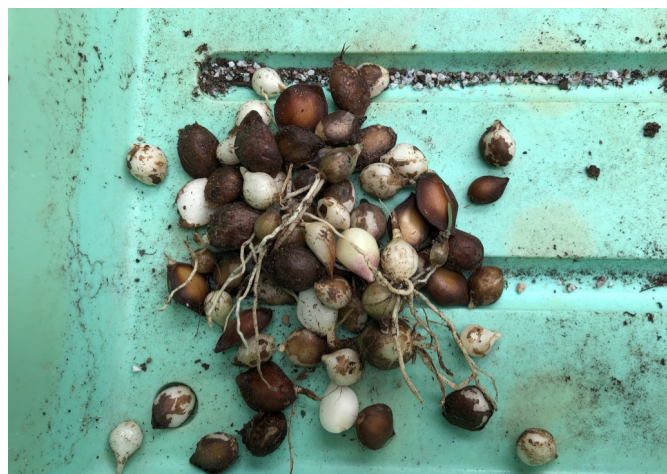
Bulblets after 4 yrs growth from one similar-sized bulb.

These have now been packaged up to share with others through the Pacific Bulb Society's wonderful bulb exchange process. In the past six years I've obtained over four hundred species (seeds and bulbs) from the PBS exchanges. I can't think of a better way to share horticultural abundance.