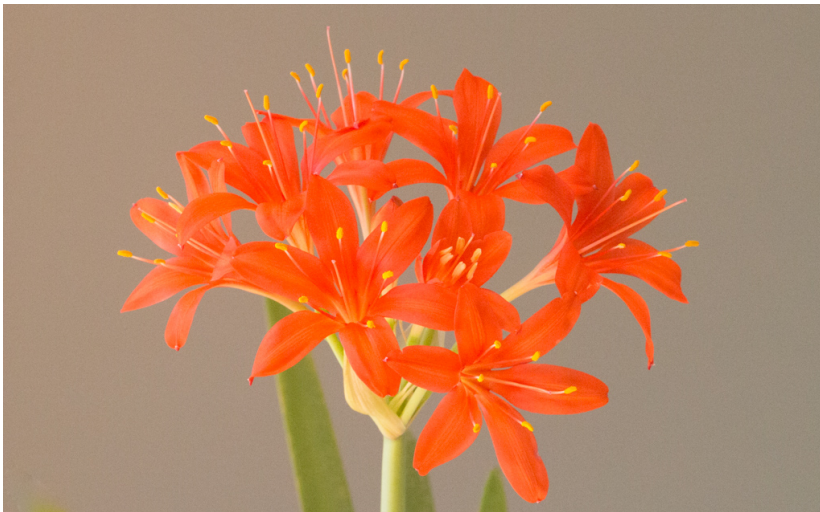
Cyrtanthus elatus x montanus

Cyrtanthus (curved flower from the greek) is an easily grown pot plant in the mid-atlantic. It asks for little care and rewards with flowers on a regular basis at the beginning of every fall. It's an evergreen in its native South Africa and although it has a short dormant season you probably wouldn't notice the paused growth in practice.