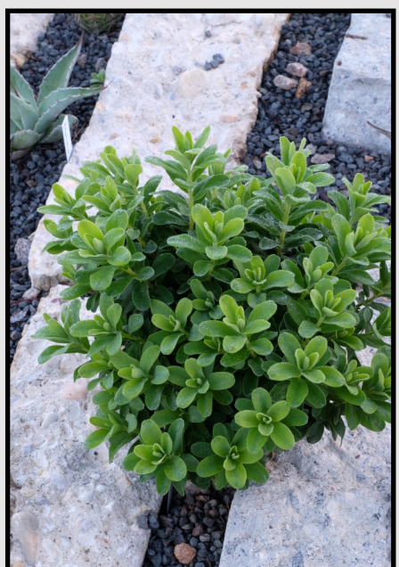
Daphne x napolitana 'Meon'