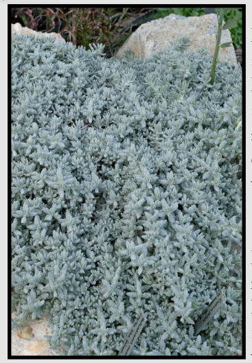
Teucrium polium ssp. aureum 'Mrs. Milstead'

Two years after the first crevices were populated, we've been amazed at how rapid and deep plants have rooted in and grown in our dry, coarse mix.