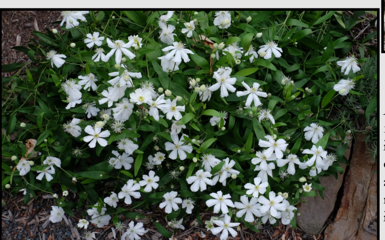
Clematis hexapetala 'Mongolian Snowflakes'

Our 2'- wide Clematis hexapetala 'Mongolian Snowflakes' has excelled in limestone—outperforming itself in compost-based garden locations. We've enjoyed an all-summer flurry of starry white four-petaled flowers.