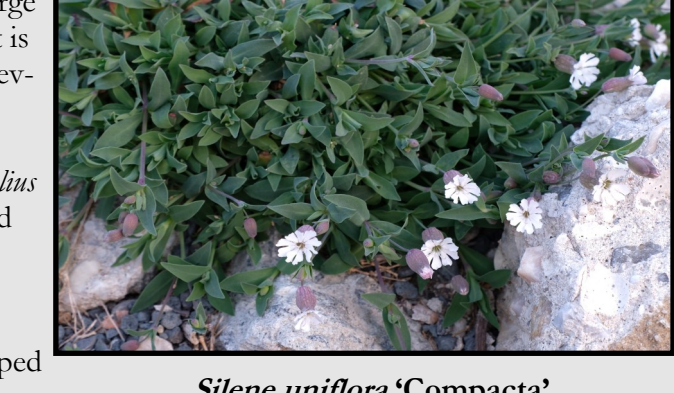
Silene uniflora 'Compacta'

Penstemon baccharifolius from NARGS seed exchange has performed extremely well for us. The specimens are topped in summer with groups of tubular red flowers