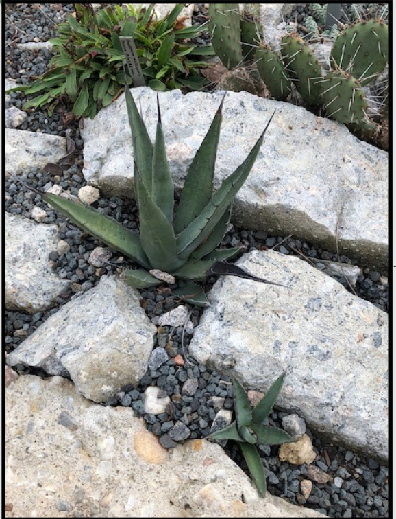
Agave x gracilipes