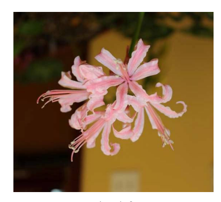
Nerine standard form