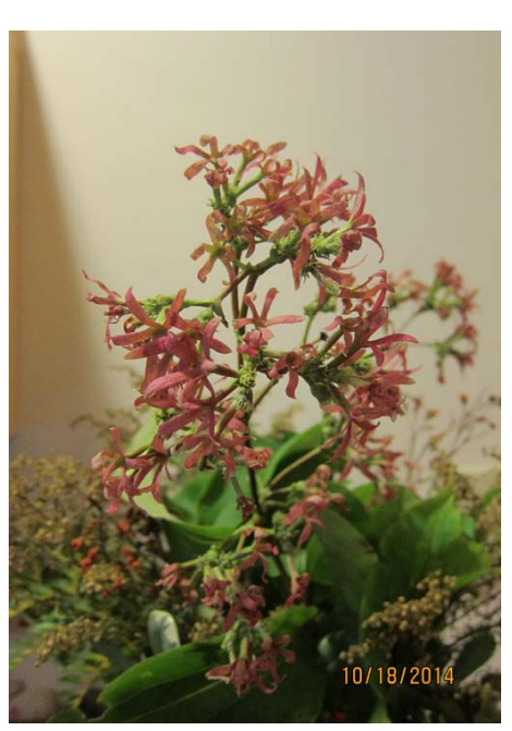
Flippo Heptacodium miconioides

The story of Heptacodium miconioides , or the seven-son flower, illuminates the trajectory of an exotic plant from discovery to propagation, to distribution and observation, and finally to the point at which it enters the nursery trade. Native to high cliffs in the western Hubei province of China, seven-son flower is rare in the wild. This large, arching shrub with exfoliating bark is covered with