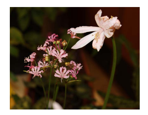
Nerine mini form