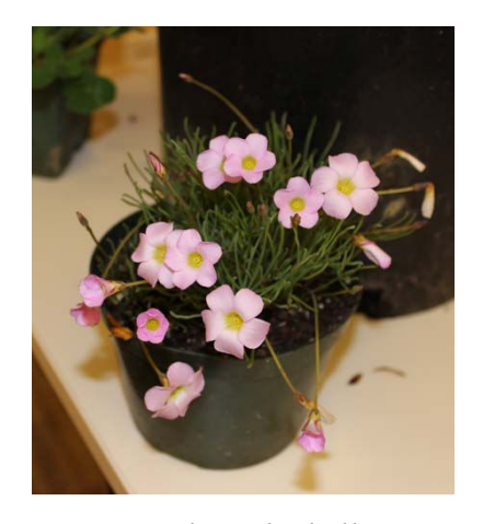
Oxalis polyphylla