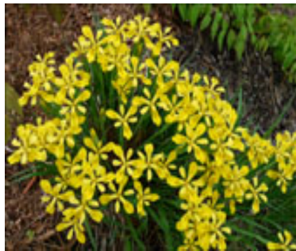
I. odaesanensis 'Firefly Shuffle' clump character