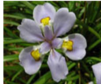
Iris. Henryi 'Mini Treasure'