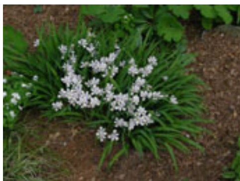
I. odaesanensis 'Chuwangsan #3' clump character