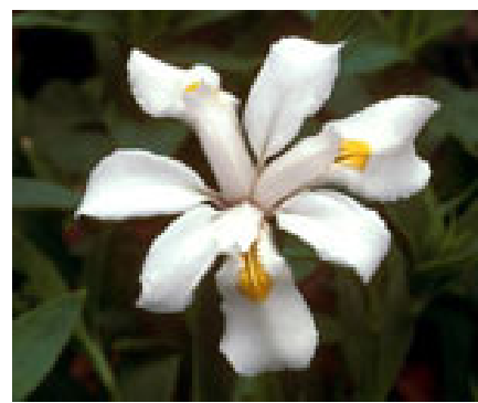
I. odaesanensis 'Chuwangsan #3' flower detail