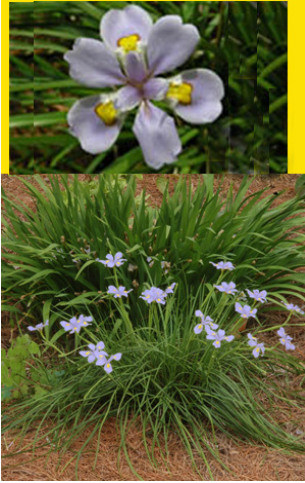
Iris henryi 'Mini Treasure'