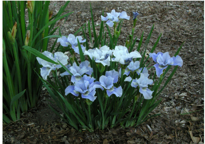
'Too Cute' clump detail