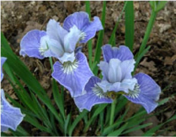
'Too Cute' flower detail