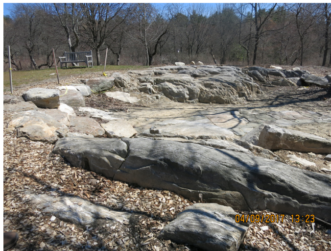
Rock garden site at the Acton Arboretum