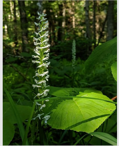
Platanthera dilatata was the first plant that didn't key out in our Weakley's Flora. From this point on, we knew we weren't Kansas anymore

lilies. The forests, especially when we began to regain elevation as we headed into Vermont, became much more coniferous in nature. Shrubs and wildflowers suddenly were appearing around us that I was unable to key out in my out in my Weakley's Flora, which had faithfully served us for as long as we were within its jurisdiction of the southern and mid-atlantic states. Orchids, which had been sparse on the journey thus far, were becoming more and more common to see. Ericaceous herbs beyond pipsissewa, including moneses and pyrola were dotting the forest floor. Summiting moosilauke, the first of New