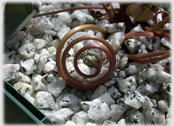
Cyclamen purpurascens setting seeds

Seed should be sown as fresh as possible, typically by late August. The same compost used for mature plants is used for seed, which is surface sown and covered with a 1/2-inch layer of grit. After watering, the pots are stood in a shady place and kept evenly moist. By late October, here, the seeds start to germinate, and the fun begins. It is beneficial to keep the seedlings, which consist of a single cotyledon leaf, growing as long as possible, keeping them cool, shaded, and well-watered. When they finally go dormant, they should be given more moisture than mature specimens, because they can be very prone to desiccation. Seedlings are potted up singly towards the end of their first summer dormancy, ideally as the plants are "thinking" about waking up. After potting, they should not be allowed to dry out at all. Some species (e.g., C. hederifolium ) can flower in their second year, but most require two to four years; C. rohlfsianum generally takes the longest, up to five years from seed sowing.