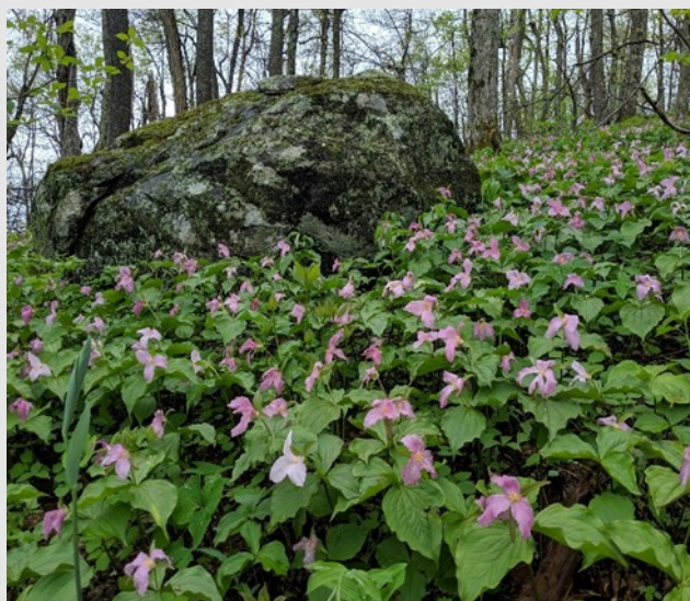
One of the most illuminating days of the entire hike happened in the Jefferson National Forest as we criss-crossed the Blue Ridge Parkway between giant colonies of Trillium grandiflorum .

I was hoping to find on the entire trail, and with the remaining two thirds farther