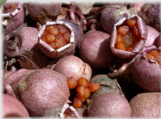
Cyclamen hederifolium seeds and seed pods

can be a problem during fall through late winter; in the eastern USA this phenomenon is very rarely an issue. Spent flowers and flower stems can act as nuclei, so it is best to remove them as soon as possible.