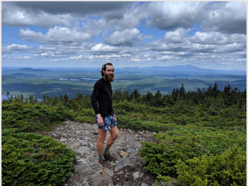
One of the reasons why the views were so hard to beat in Maine. This was the first glimpse of Katahdin, just under halfway through the 100 Miles Wilderness.

The last few hundred miles of Maine were similar to what we had seen since Vermont. Vast coniferous forests between treeless summits dotted with mats of alpine plants, interspersed with occasional mountain top bogs colonized with eriophorum, platanthera, rubus, drosera, carex, and more. I marveled at them as I had been doing along the whole trail, but for the first time for me, the views were actually taking the place of the most beautiful sights of the hike. The wilderness that we experienced in Maine was unmatched anywhere else on the entire trail. I remember thinking about how John and William Bartram would have seen all the landscapes that we had seen as we