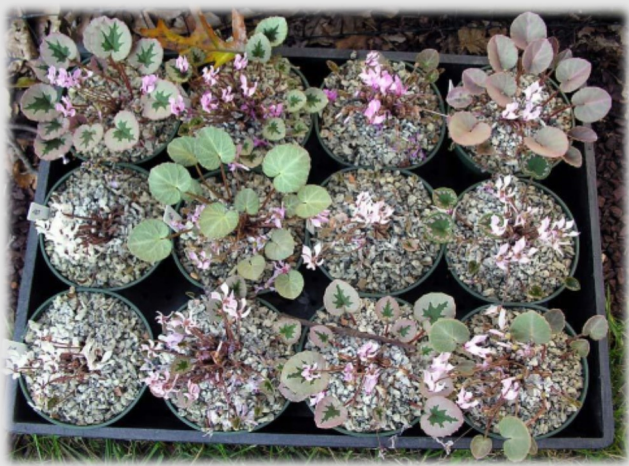
Cyclamen mirabile Tilebarn Anne and Tilebarn Nicholas