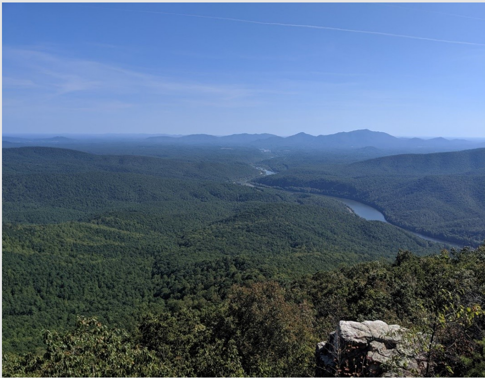
There could not have been a more perfect sendoff than being greeted by the James River under clear blue skies to end our botanical foray into the Appalachian Mountains.

The opportunity to botanize the entire range of what I call my home mountains, beginning before the first buds of spring opened and finishing as the fruits of autumn were falling to the ground, was something I never knew that I needed to do. To become intimately familiar with the Appalachian flora through firsthand observations over the course of a whole growing season and across almost the entire range of the mountains was simply an indescribable experience. The plants that we saw were only a small part of the trip as a whole, but they played such a central role in the journey, stitching together our experiences as we walked each day from one campsite to the next.