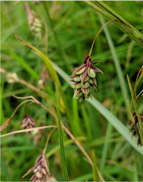
Carex magellanica , one of the many species of sedge that were present in the bogs of the northeastern section of the trail.

While the diversity of the flora in the northern section of the trail was perhaps slightly less than what we had encountered in the south, the variety of habitats that were new to us kept us on our toes all the same. We came across our first bogs, filled with sundews and pitcher plants on sphagnum laden shores. Beaver ponds that were ringed with spiraea, viburnum, and Ericaceous species held large mats of floating spatterdock and water