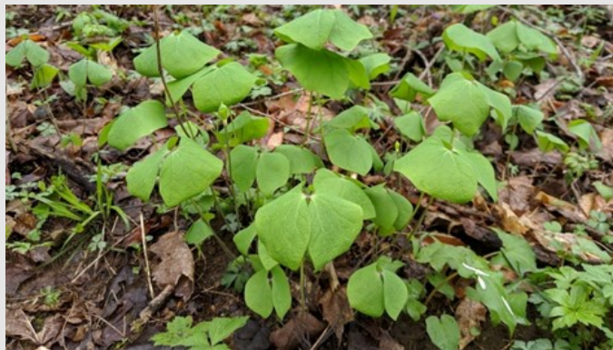
One of the most exciting discoveries of the trail, this was one of two patches of Twinleaf ( Jeffersonia diphylla ) that we came across in Virginia.

To be enveloped by spring each day as you wake up and walk along a mountain trail was electrifying. Every day, I knew we would be finding new treasures potentially at every turn, all the while being treated to some of the most miraculous landscape views in North America. From the Smokies, we quickly crossed over Max Patch, the Roan Highlands, Grayson Highlands, and into the Washington and Jefferson National Forests. By the time we got to the James River in early May, we had seen everything from skunk cabbages to Catawba rhododendrons flowering on the trail. The first seven hundred miles had delivered more to us in terms of plant diversity than