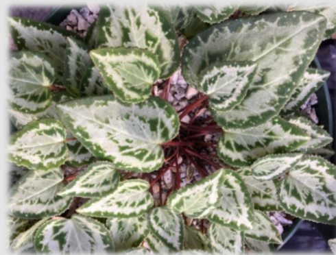
Cyclamen graecum ssp. candicum

Botanically, C. graecum is now split into two subspecies: ssp. graecum from Greece and its islands, including most of Crete but excluding Rhodes, and ssp. candicum from a small area of the White Mountains in Crete. Cyclamen graecum ssp. anatolicum from Turkey, Rhodes, and North Cyprus is now Cyclamen maritimum . All forms are beautiful plants, with leaf markings second to none in the genus: various shades of green, cream, gray, and silver form intricate patterns that include shields, borders, splashes, and veining. The leaves, which may be