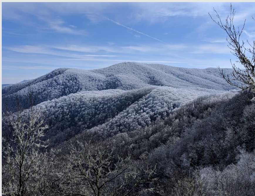
The beginning of our hike saw much more ice than wildflowers. Here is a view near Wayah Bald, NC, taken on March 5 th , the morning after a fifteen degree cold front froze most of the rain from the day before.

Our hike did not start off with a whirlwind of botanical treasures. Hiking out of Amicalola Falls State Park on February 18th, we realized that we were decidedly still in the midst of winter as we summited Springer Mountain. While we kept our eyes open for signs of color on the forest floor, we kept ourselves entertained by taking note of the dormant shrubs and trees around us, learning to appreciate the buds that would soon give way to flowers and foliage. Except for the odd houstonia or cardamine, it took twenty days and a hundred and sixty miles to see our first significant wildflowers, patches of toad trillium at Lake Fontana just before entering the Smoky Mountains. And after that trillium patch, save for the odd claytonia popping out at high elevation in the Smokies, another two weeks would pass before what we could comfortably call spring was upon us. But when it came, it came