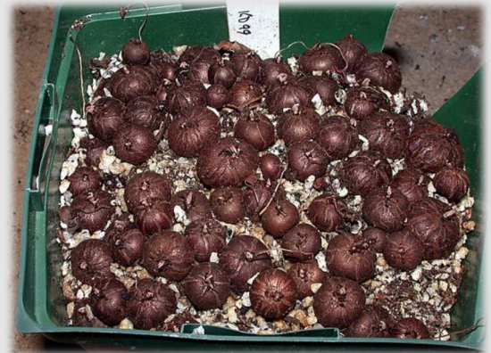
Cyclamen graecum seedlings

Cyclamen suffer from relatively few pests and diseases, especially if the plants are observed regularly and re-potted as necessary (under-pot rather than over-pot). Species with deeply delving roots, such as C. graecum , benefit from deeper pots. As discussed above, too wet a medium will cause the corms to rot. By the time this is noticed, either because the plants make no new top growth after dormancy or because the leaves and flowers wilt and yellow prematurely, it is usually too late to remedy. In the UK and in the US Pacific Northwest and Canada's West Coast, botrytis