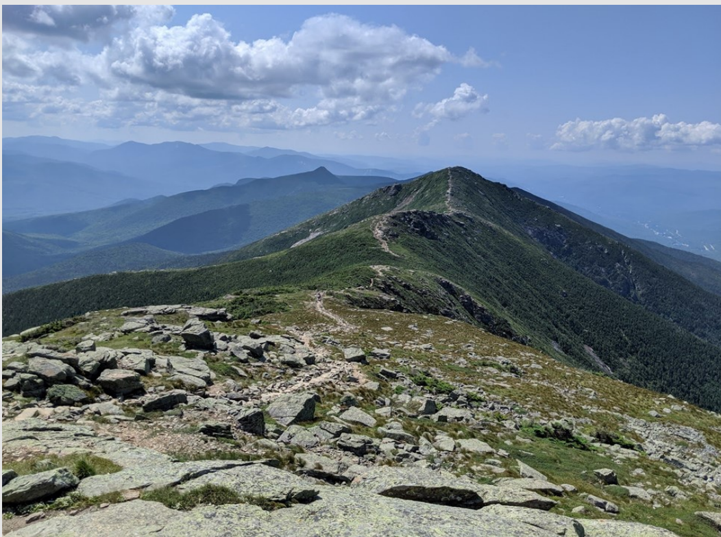
The imposing view back over Franconia Ridge, home to Geum peckii and Potentilla robbinsiana . This was, without a doubt, one of the most scenic days of our thru-hike.

After a small off-trail break, we resumed our hike