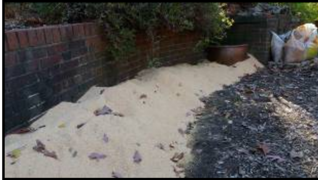
photo 4 shows the 3 inches of sand.

After creating the layers of soil, I started to place and group the tufa rock.