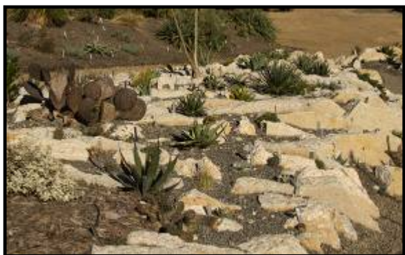
Crevice garden, PDN