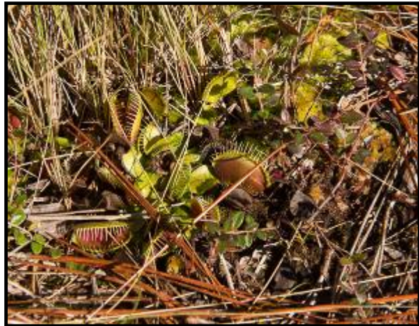
Venus fly trap

Typical of this sandy habitat were three oaks: Sand live oak ( Quercus geminata ), Sand laurel oak ( Quercus hemisphaerica ) and Turkey oak ( Quercus laevis ). Other plants seen included Groundsel bush ( Baccharis halimifolia ), Yaupon holly ( Ilex vomitoria ), many different grasses and a striking shrub called Coral bean ( Erythrina herbacea ) with arrowhead-shaped leaves and brilliant red berries in long leguminous pods.