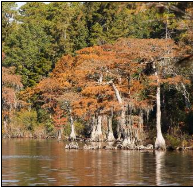
Taxodium ascendens, Jones Lake