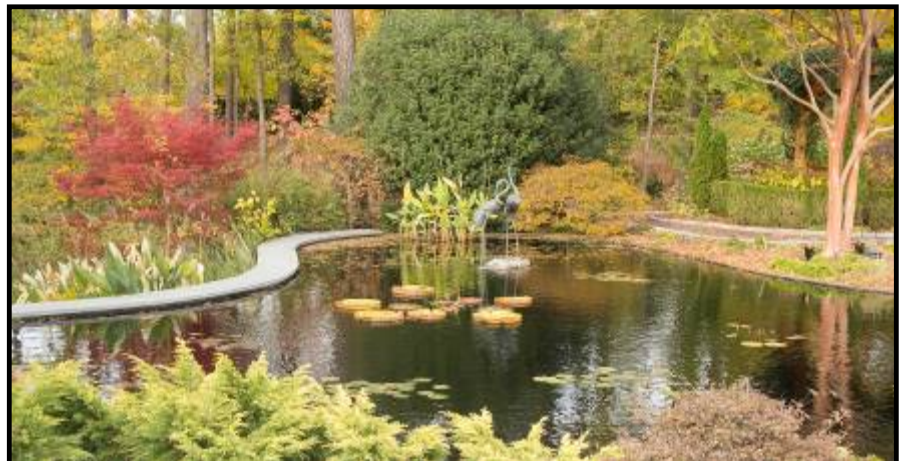
Fall color at Sarah P Duke gardens