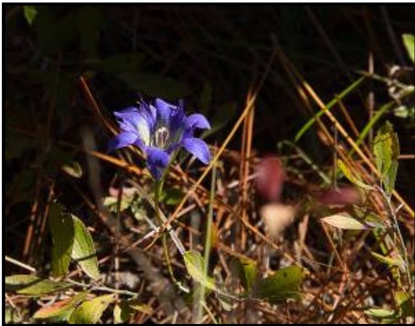
Pine barren gentian Coastal Forest.

Our last stop was that afternoon--we explored Carolina Beach State Park next to the Cape Fear River, a transitional zone for salt water and freshwater plants called a Maritime Evergreen