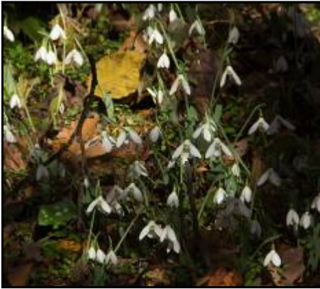
Galanthus , Nancy Goodwin's garden

Note new web address: www.rockgardencmetro.org