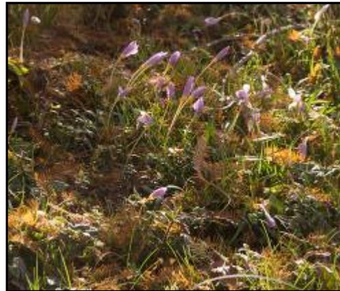
Fall crocus, Nancy Goodwin's garden