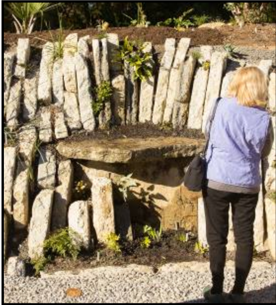
Crevice garden, PDN