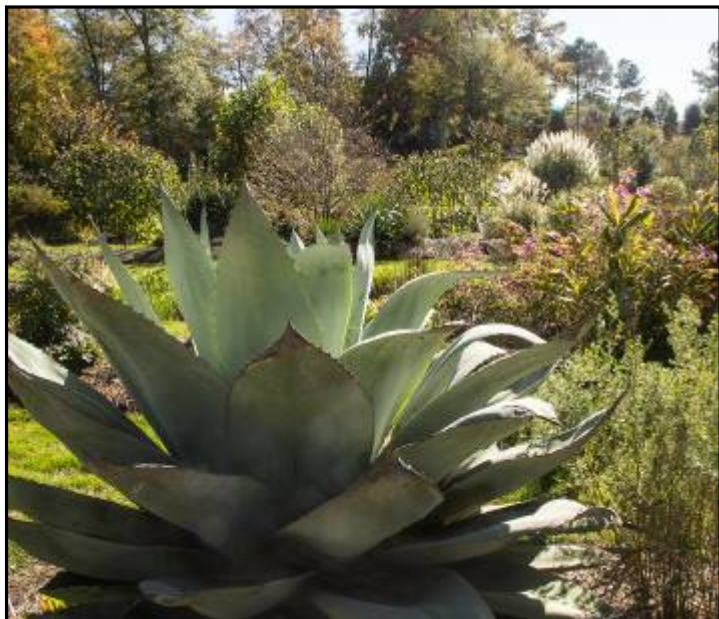
Display garden at PDN

If you've been toying with the idea of attending a NARGS annual meeting, I encourage you to jump in and sign up. I have thoroughly enjoyed attending them over the last several years. You'll start to see familiar faces after just a few meetings and make new friends while exploring the environs of each location with garden enthusiasts from all over the country. Attendees usually include a sprinkling of guests from other countries as well. Most meetings offer outstanding lectures, amazing images of plants, fabulous field trips, plant and book sales, and opportunities to experience local food, craft brews and more. In short, adult camp for garden geeks.