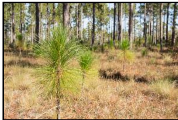
Long leaf pine forest

In the afternoon we visited Lake Waccamaw State Park where two unusual plants were found: