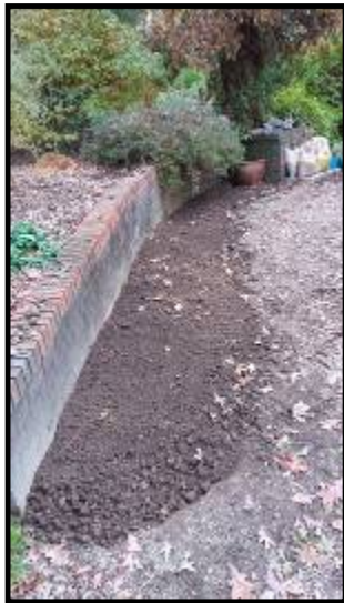
Photo 1, left, shows the area after all plants were removed and 3” of topsoil carted away. The space is ready for a lean rock garden mix with super drainage!

Many years ago I purchased a dozen attractive tufa rocks from a local Maryland nursery. I thought these porous, irregular shaped stones were good candidates for such a space, but I only had about a dozen. My rock garden would have to be fairly limited in size. It would not be a huge expanse of scree or crevices with large rocks. Blending it into the overall garden design on my ½ acre lot was also important to me. So, I looked for a small, self-contained, area. I settled on a 20-foot long by 4-foot wide space that runs parallel with a brick retaining wall and separates the flat area of the property from the hillside. Luckily a path also runs parallel to this brick wall and new rock garden space, so miniature plants can be easily viewed and appreciated up close. The brick retaining wall would also allow me to raise the soil level by mounding it against the wall.