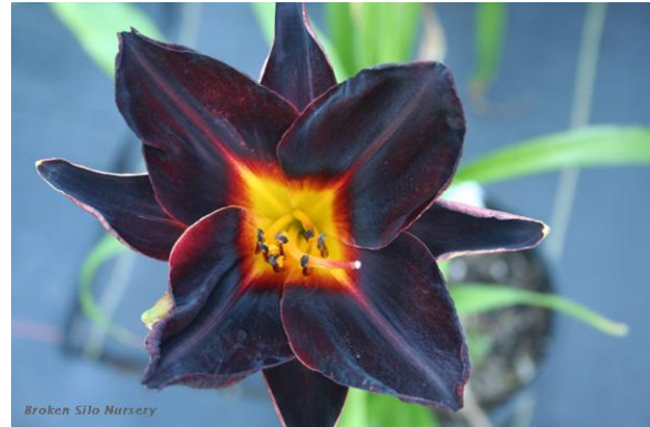
Hemerocallis 'Ed Mercer'

But I never thought I'd be back in the nursery business again, though there were days I longed for it, remembering the good ol' times—the sadness was often rearing its ugly head. Yet, I had a job that paid well with a euphoric sense of corporate provided security, and I found a little time here and there to pursue my other passion—writing.