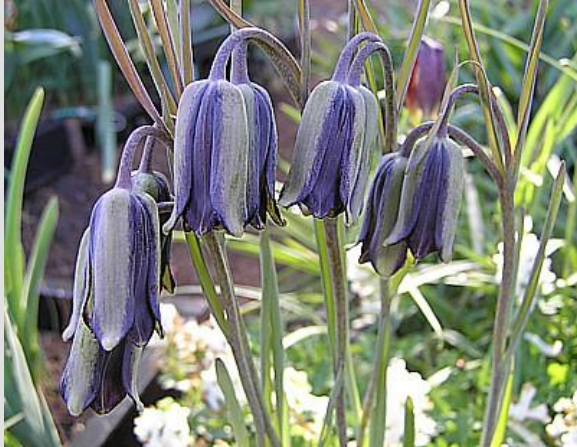
Fritillaria elwesii