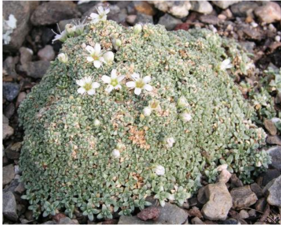
Gypsophilia aretoides

Yes. Deep down I know that I'm an idiot and the worst businessman on the planet. Reopening