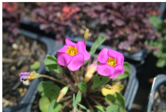
Oxalis 'Dark Dick'

It would be four years before our first catalog, as we built stock, a customer base, and tried to define ourselves in a very crowded marketplace. Specialty nurseries were everywhere, bookshelves were full of volume after volume of botanical treasures—can you imagine walking, today, into a Barnes and Nobel's and finding a copy of Duncan Lowe's, Cushion Plants for the Rock Garden on the shelf? —people were seriously gardening! And they were serious about gardening—and not just becoming “Master” Gardeners.