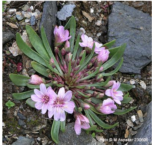
Lewisia pygmaea – photo by Magnar Aspaker

just pennies above wholesale—because they make their money off either other merchandise (and view plants as just a marketing ploy to get customers into the store), or off of volume sales, or off of all the branding and trademarking that results in selling items at huge prices because namesake? How can the small nursery, the ones that have made it their lives to be as knowledgeable about the plants as possible, survive in a climate where customers have been conditioned to trust only the Garden Centers—you know, the ones’ populated by a fleet of college students that can’t successfully manipulate a calculator, much less understand that Petasites is not a tree.