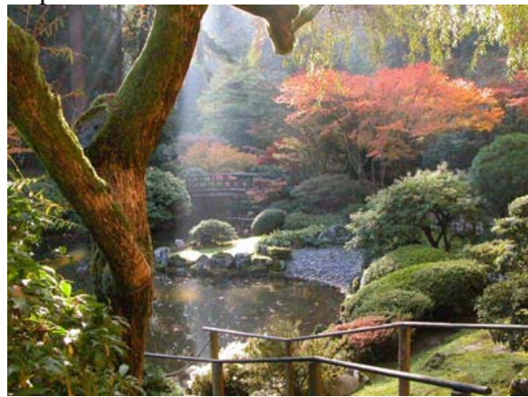
The Japanese Garden in Summer

Peter rented a car and early Friday we set out for Cistus Nursery, located at the end of a little island in the Columbia River a half hour away. Its director, Sean Hogan, had contributed the general design and a number of the plants for the excellent Classical Chinese garden occupying a block of the former Chinese quarter across the river from our conference hotel, an experience that took him into growing zone-defying hardy tropicals.