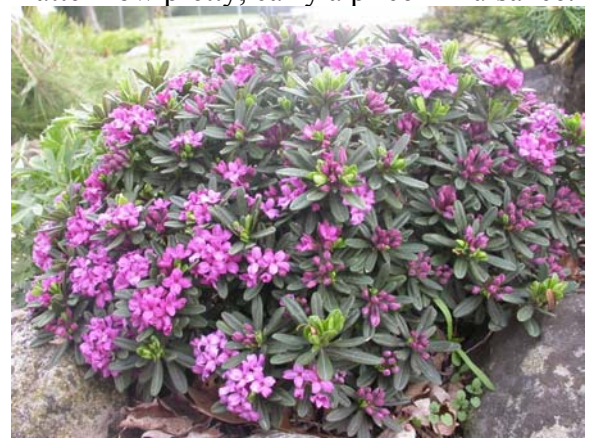
Daphne 'Lawrence Crocker'

planting, a common practice of the nursery/landscape trade to sell plants and satisfy the urge to make it finished. One can do this in the rock garden with fast-growing mats like Veronica liwanensis or V. oltensis . Mildly thuggish, they can be ripped back if spread out of bounds. Some plants can grow in these mats, but I find it rather too competitive for choice plants. Ground cover plants like Geranium sanguineum can grow over and eliminate others very easily; and, though it can be dug out, any remaining pieces of root will allow it to re-establish. Choice of plants is critical. Weedy plants, no matter how pretty, carry a price in nuisance.