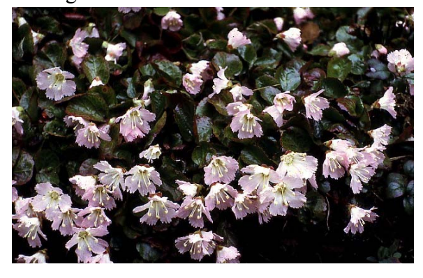
Shortia uniflora 'Grandiflora Rosea'

selenium. The geography and topography of the locations was just as compelling as the plants themselves. It's a wonder that these alpines can tolerate the tameness of a rock garden or trough after adapting to such exotic places. Alan has had a remarkable career, following the reproductive cycle of thousands of species and helping preserve the vegetation of the wild west.