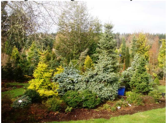
Abies Bed

alpine garden when the flowering plants are dormant. They offer color, texture, and form to the garden throughout the entire year.