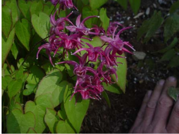
Epimedium x 'Kuki'

spidery flowers and brilliant spring foliage add excitement to the shade garden.