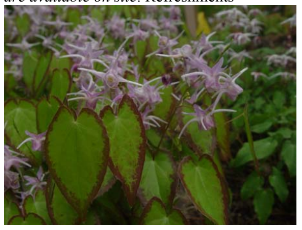
Epimedium grandiflorum 'Swallowtail' – photo by Darryl Probst provided. For more information or to have a

Come to our open nursery days Fri.-Sun. May 8-10 & 5-17 and Sat. May 23 (new this year, in order to see the later blooming Chinese species in flower) 10am-4pm. The nursery is located at 63 Williamsville Rd, Hubbardston, MA. This event will be held rain or shine, and is the only time that the nursery is open to the public during the year. We will answer your questions and have a selection of plants for sale, but not a comprehensive offering. If you have your heart set on specific varieties; send your order ahead of your visit so we can pull it in advance. To protect our research collection, please leave children and pets at home. Some uphill walking on uneven dirt surfaces is necessary. Sorry, no restroom facilities are available on site. Refreshments