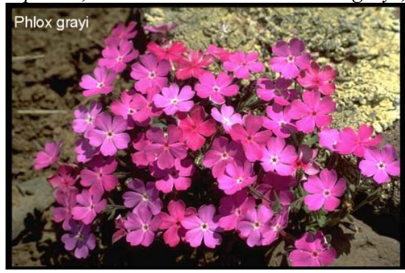
basalt slablands in Idaho for beckwithii, and red sandstone slopes for Astragalus saurinus, which tolerates

access, as in the 3-inch pods of Astragalus megacarpus, but it requires hours of painstaking work with tweezers to extract from Astragalus hyalinus, "vegetable sheep" of North America. His explorations have taken him to limestone outcrops in Death Valley for Mimulus rupicola, volcanic hills for Phlox grayi,