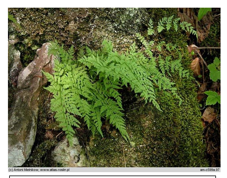
Cystopterus fragilis, another excellent fern for the rock garden

Ferns in the woodland setting: Oak Fern ( Gymnocarpium dryopteris ), Himalayan Maidenhair ( Adiantum venustum ) and Christmas Fern ( Polystichum acrostichoides ) with Gentiana scabra var. saxatilis . The author's garden.