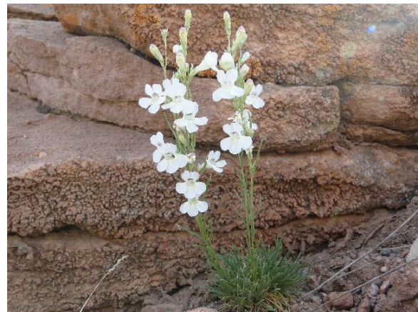
Penstemon laricifolius v. exilifolius

If you are interested in learning about Penstemons, one of the best ways is to join the American Penstemon Society and attend the annual Penstemon Society Meeting. This year the meeting was held in Laramie, Wyoming. It has been hot and dry in Wyoming this year but, even in a dry year, there are always a surprising number of interesting plants to be seen when you go out on field trips. Obviously Penstemons were the target plant at this meeting but, with the drought, the Penstemons were not