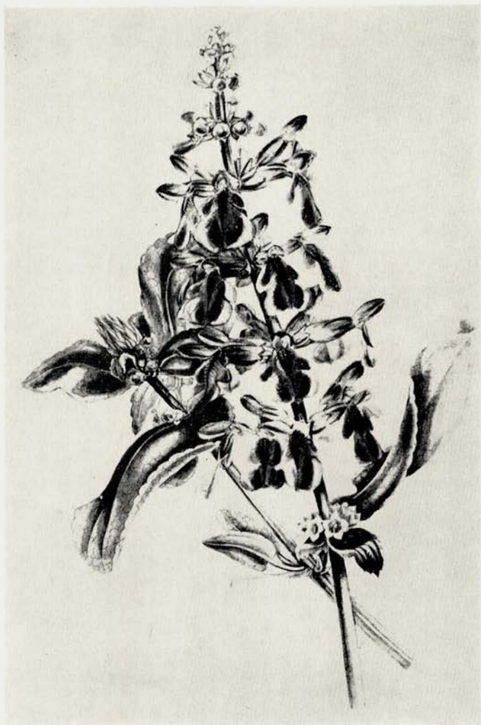
Stachys coccinea Paxton's Mag. of Botany 8:101. 1841

bined length of the calyx tube and teeth, and are reddish purple. This species is native in northern Asia Minor. Though it is reputed to be in the trade in this country, we have no herbarium records of horticultural material, nor any information on hardiness. In England it is said to be extremely sensitive to excessive moisture during the Winter.