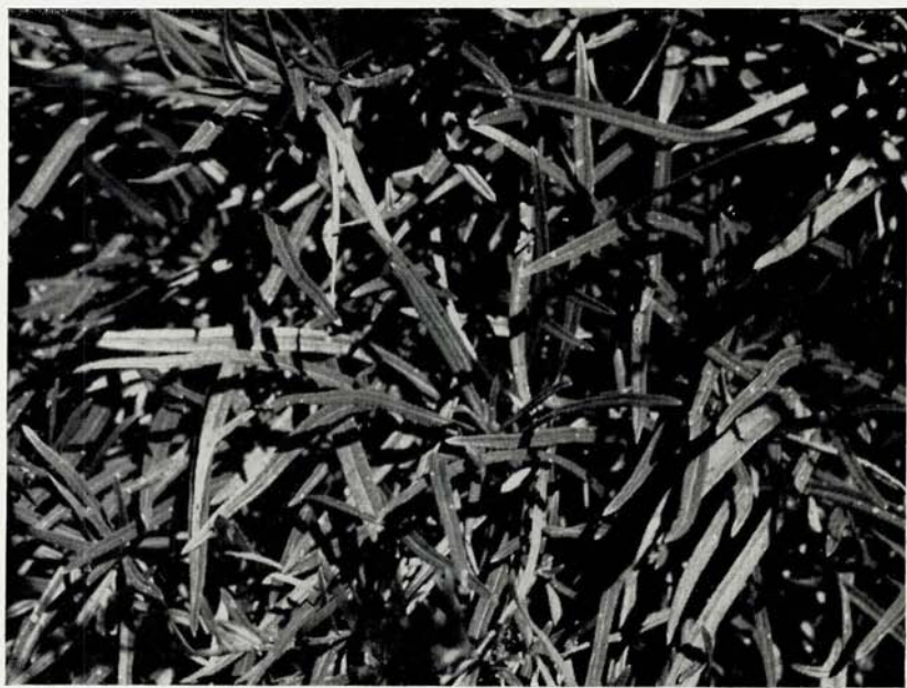
Lithospermum x intermedium