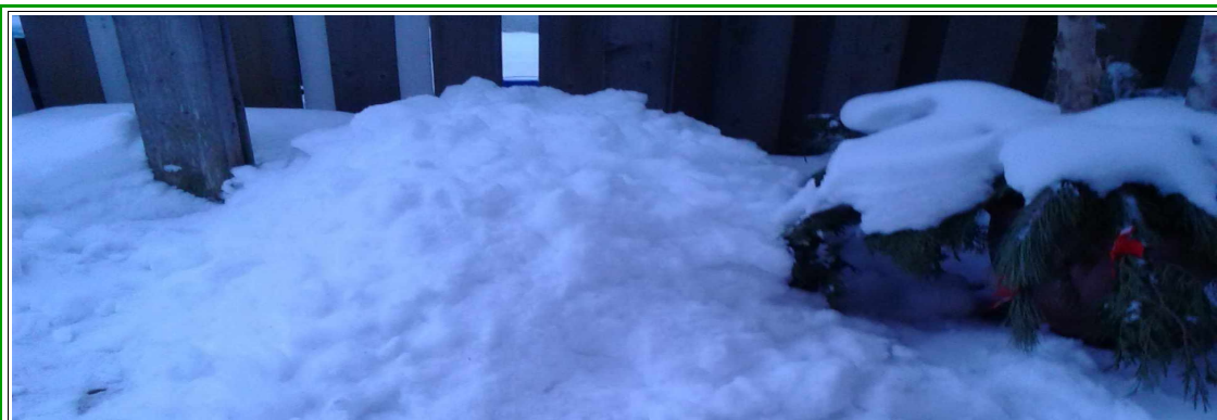
Winter sowing (mini greenhouses are under the pile of snow)