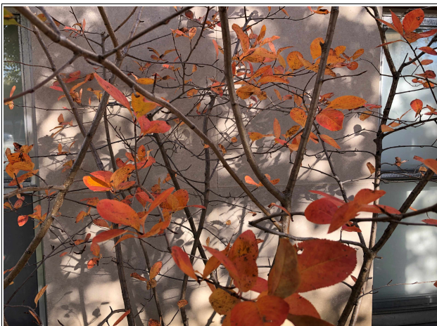
Fall chokecherry