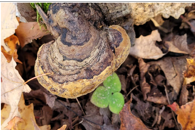
Bracket fungus and Hepatic acutiloba leaf

We welcome photos and stories for the newsletter, especially from recent events of the society. Next deadline will be 2 weeks before our next virtual or in-person meeting.