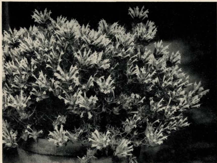
For a climate suited to Spanish plants Thymus longiflorus makes a striking bushlet.

Thymus membranaceus , from the hot hills of Spain, has been grown in England for some years now, and I believe it is not unknown in the gardens of connoisseurs across the Atlantic, but we have recently been introduced to another Thyme, also a Spaniard, and of somewhat similar general appearance, but even more striking. This too, has recently received the coveted Award of Merit. It is an intensely aromatic bush of some nine inches, with rigid, many angled stems clad in grey-green leaves. The long, tubular flowers of soft lilac are produced from great papery calyces, which are themselves flushed pink and mauve. Its name is T. longiflorus , and it is, as can be seen from the photograph of the plant which gained the Award, extremely free flowering. It is not a plant for