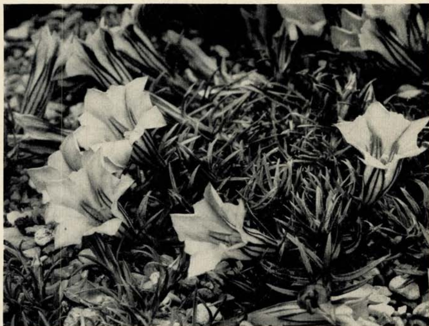
The hybrid gentian farorna is one of many forms recently named and introduced, deep, clear blue and very dwarf.

Well, the summer is ending, and a difficult season it has been. There have been short spells of warm, sunny weather, but on the whole it has been dull, and with far too much rain. We approach the winter with too much lush, soft growth, and I fear the consequences of early frosts.