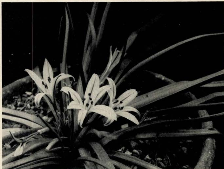
Asphodelus acaulis , with deep pink flowers on very short stems, is hardier than most African plants.

of long, rather lax green leaves stand erect at first, but fall apart and reveal the almost stemless flowers in spring and early summer. The blossoms are deep pink, with prominent, rather dark stamens, and the beauty of this interesting plant is well revealed in the accompanying photograph of a plant—grown, incidentally, in a deep fern pot, a very successful method of cultivating it where there is doubt as to its hardiness, or if it is required to decorate an alpine house.