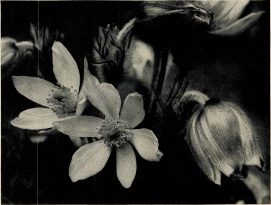
The old favorite, Anemone vernalis deserves what special care it may require.

that I ventured to include it. A. vernalis is not really difficult to grow, but it is not always easy to make it flower in cultivation. The buds always form in the late summer and autumn, and remain, silky-haired and full of promise, buried deep in the heart of the plant during the winter. I believe it is the winter conditions which determine success or failure. We cannot duplicate the natural conditions, which cover the plants with a blanket of snow for several months, and we cannot ensure that they will not be induced to make several false starts into growth, encouraged by spells of mild weather. If, however, the buds can greet the spring unharmed, and grow away rapidly when winter has finally departed, then we are assured one of the most lovely sights which can delight a gardener's heart, as the great goblets of opalescent pearly-white petals expand,