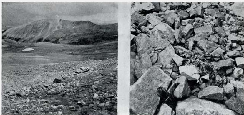
The home of Penstemon harbouri

Plants which I have selected at Como in August while in bloom—choosing those of especially good color—have behaved beautifully in the garden, losing that hang-dog look without becoming too lush or overfed. These have retained their good behavior for some four or five years and,