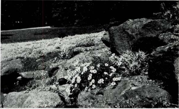
Melampodium cinereum and Echinocereus triglochidiatus nestled in the rocks, with a drift of Penstemon beyond

planting peaceably. This pleasant trait is, unfortunately, offset by its impermanence. There's a suspicion that it blooms itself into extreme fatigue and too late in the season to recover vitality to survive winter. Treat it as a biennial and it will be a welcome inhabitant of the rock garden.